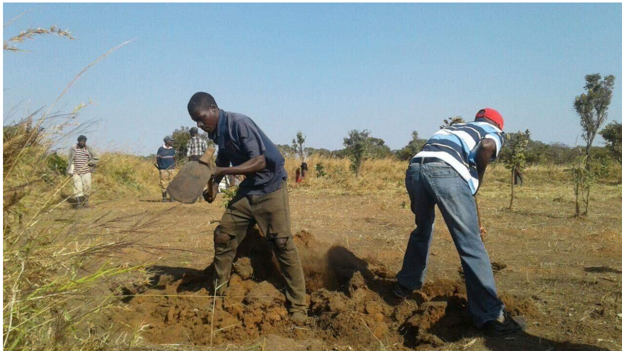
People digging the mud pit for making bricks for the preschool structure 1