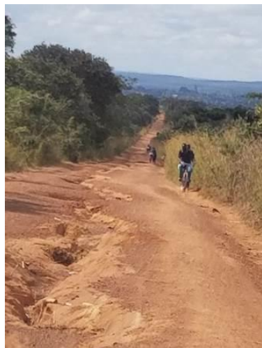
The Road Leading to Mwambezi Village