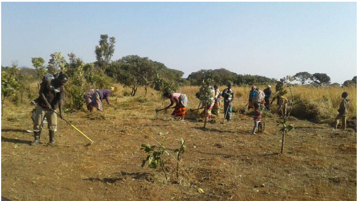
People clearing the area for making bricks for the preschool structure 3