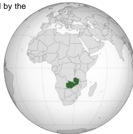
Location of Zambia on the Map of Africa

The road leading to Mwambezi village has a ditch in the middle due to erosion from running rain water. Such a poor road just makes it hard for the people of Mwambezi village to be reached by the rest of the country.