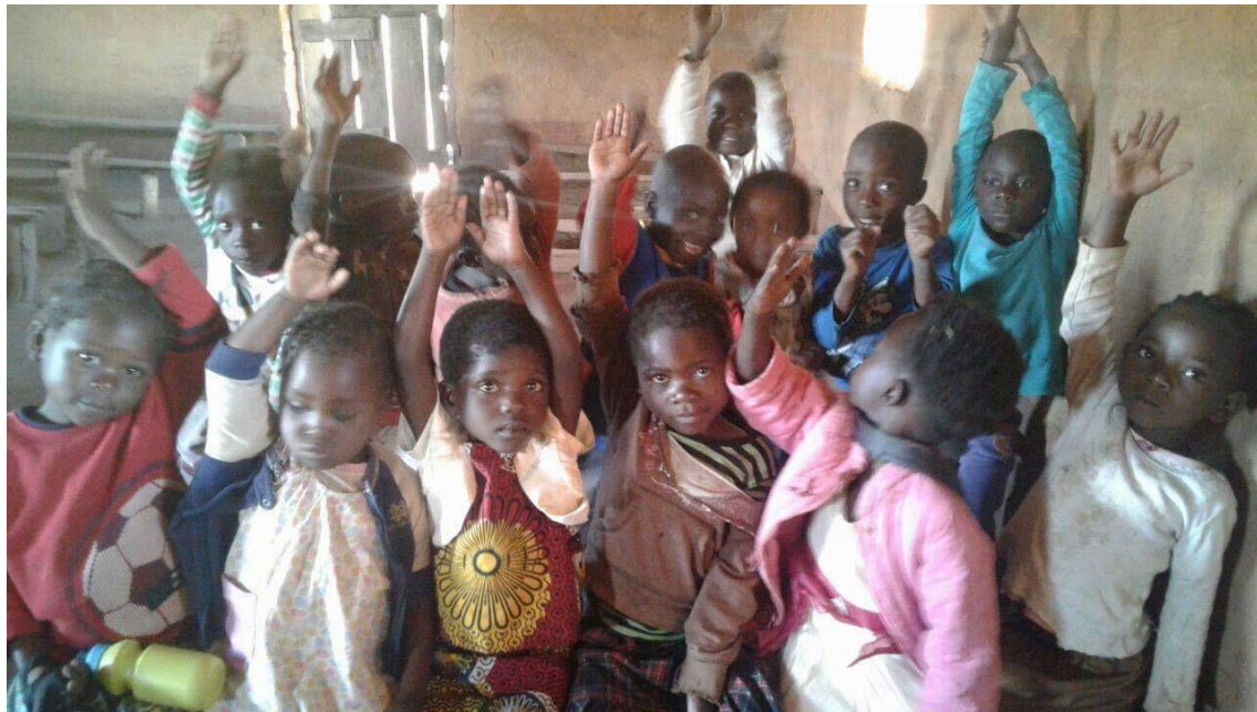
Preschoolers in Class inside the rented church at Mwambezi Village