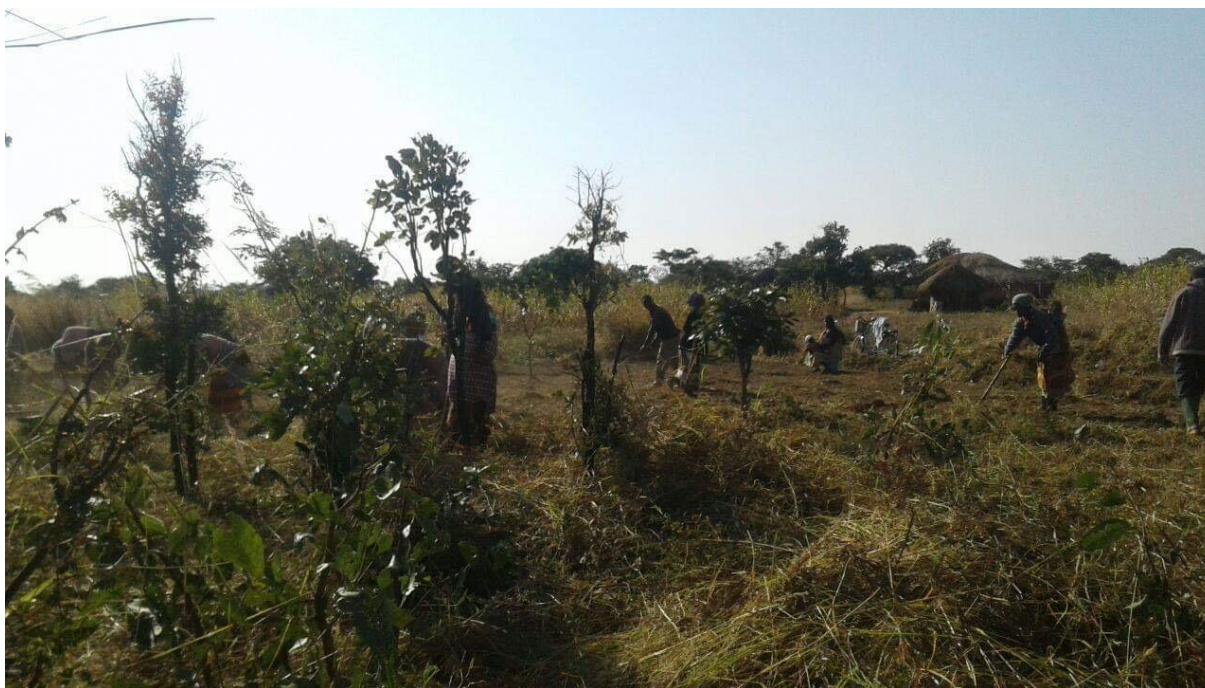
People clearing the area for making bricks for the preschool structure 1