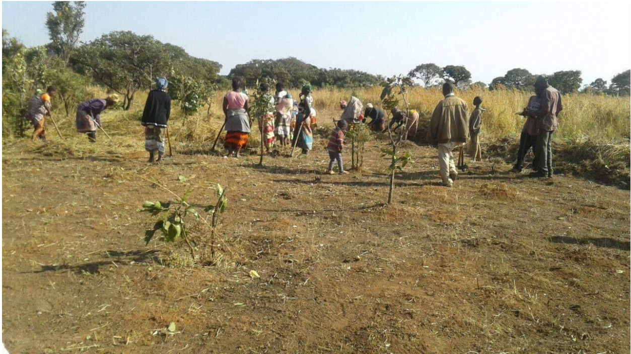
People clearing the area for making bricks for the preschool structure 2