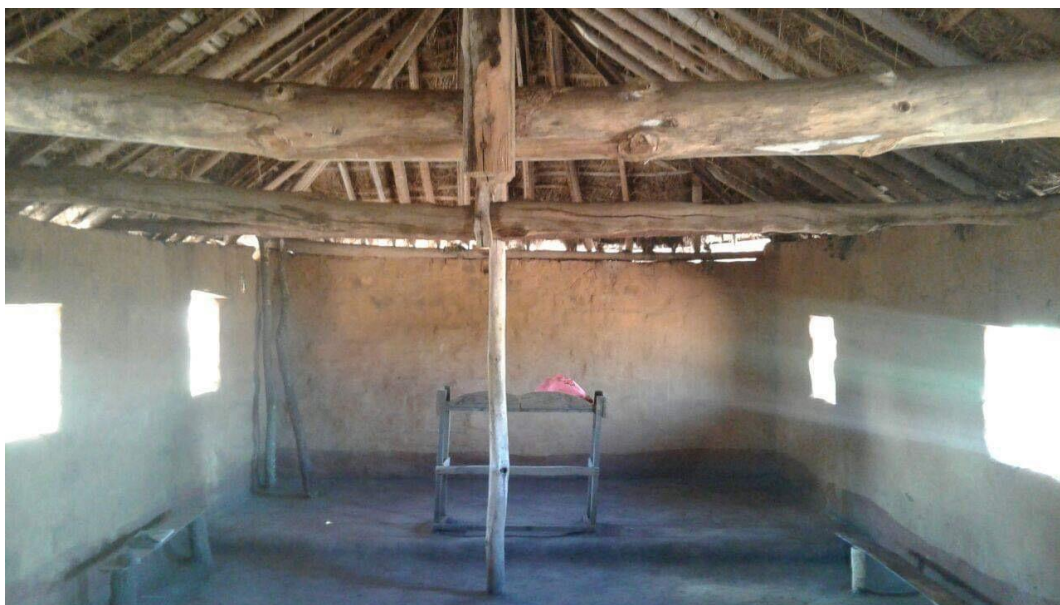
Inside the rented church for the Preschool at Mwambezi Village