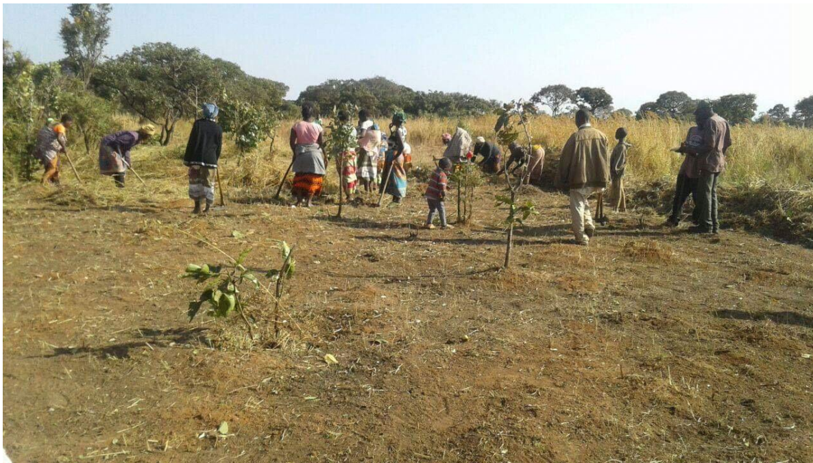
The people of Mwambezi Village clearing the place for making bricks for the preschool

PHOTO by Wisdom Simbeya / Ntungo Noble Images . . . See Story on Page 3