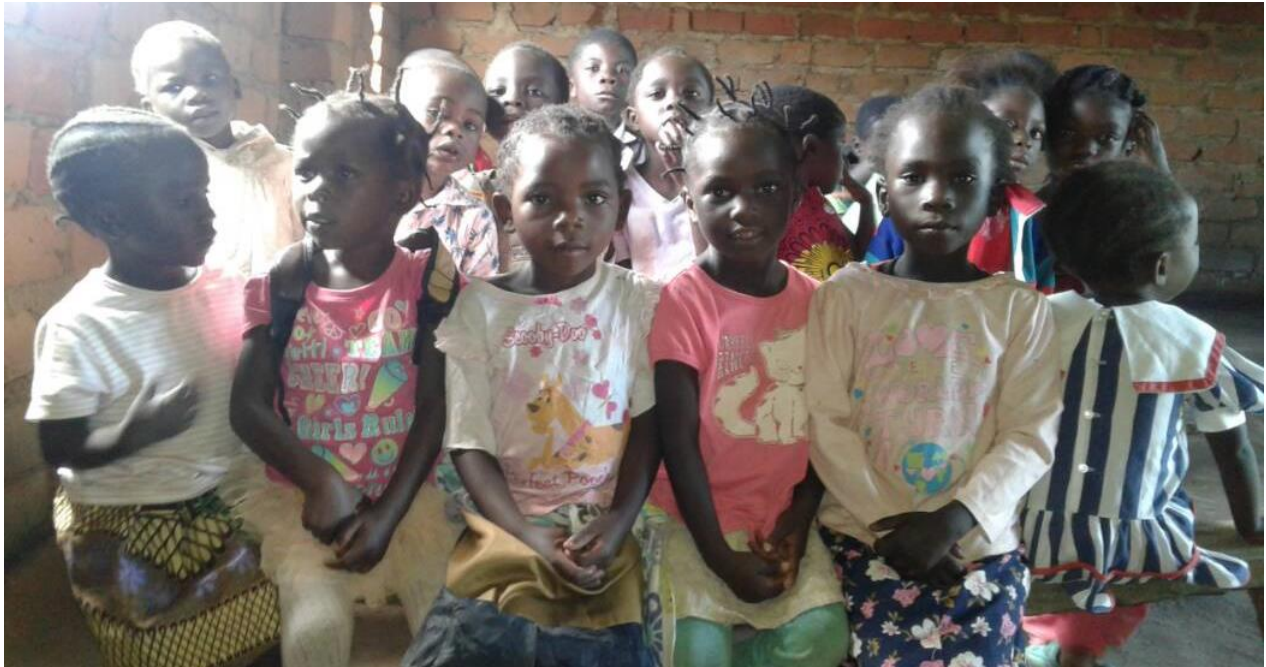
Preschool Class at Mwambezi Village

The second challenge the people of Mwambezi face is taking children to school. In order to attend school children have to walk 12 km to the nearest school. 12 km does not seem much for an adult. But for a child it is not easy. This is a barrier to education for most children at Mwambezi village. Further, before a child can attend school, they must pay a school fee, buy new uniform and have school supplies. This is a nightmare for most families. Most families do not just have the money to afford taking children to school.