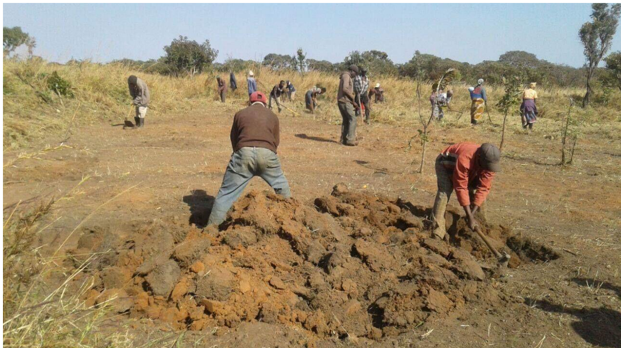
People digging the mud pit for making bricks for the preschool structure 2