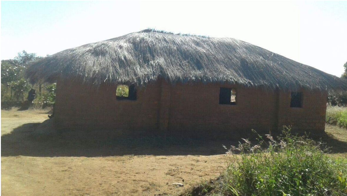
Rented church for the Preschool at Mwambezi Village

On THURSDAY JUNE 6, 2019 the Ntungo Noble Office received pictures showing the progress being made by the people of Mwambezi village to construct a structure to meet the immediate accommodation needs of the preschool. Since March the preschool is being held in a rented church that has no blackboard and no desks. Preschoolers sit on pews of the church and the teachers have no desks or chairs.