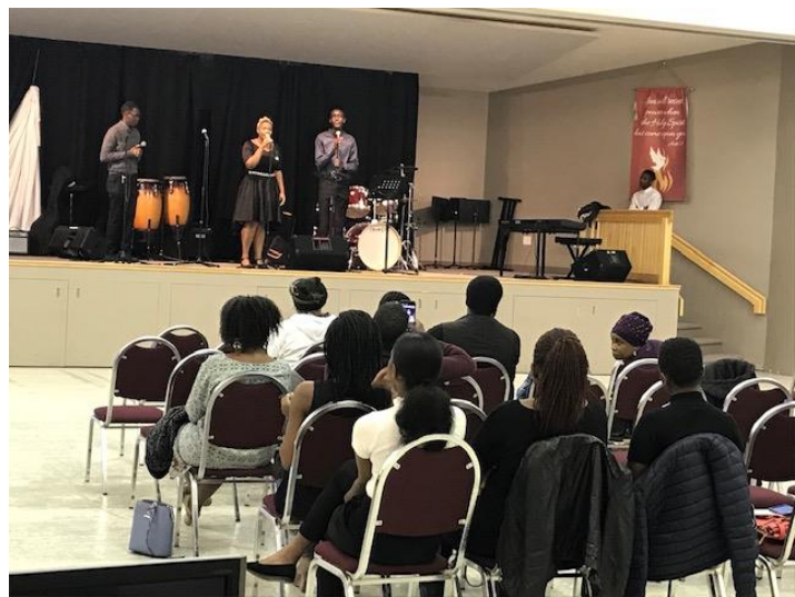
Picture of the Musical Fundraising Event Ntungo Noble Images

Ntungo Noble management and the fundraising team extend their gratitude to everyone who supported this event by buying tickets, making financial donations, attendance and participation. Your support is much appreciated.